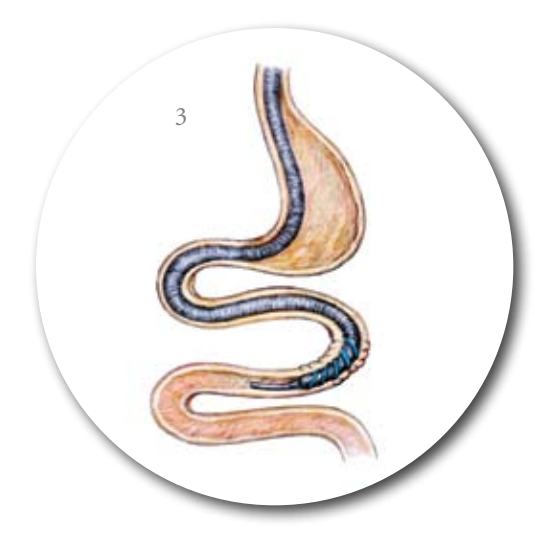
Beyond the Ligament of Treitz, clockwise rotation pleats the small bowel.