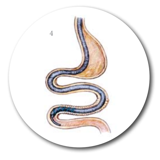
Counter-clockwise rotation of the Discovery SB releases the pleated intestine.