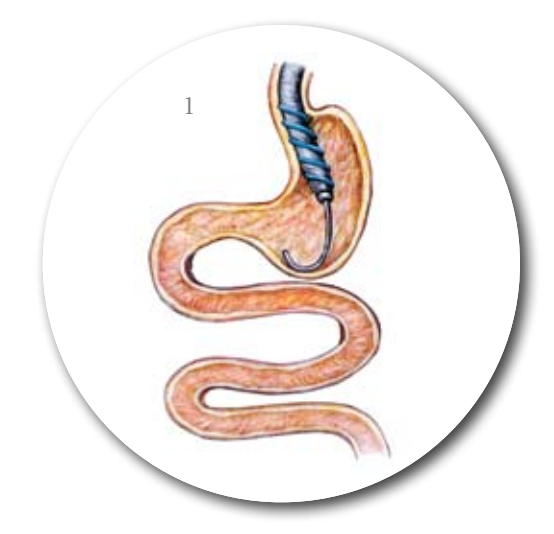
The Discovery SB is rotated and gently advanced to the antrum.

The Endoluminal Advancement System by Spirus Medical enables endoscopes to be inserted, advanced, and positioned within the GI tract. Pleating of the small bowel by rotation of the Discovery SB spiral is known as "spiral enteroscopy." Advancement into the small bowel is achieved with clockwise rotation of the Discovery SB over a compatible enteroscope. A coupler allows the Discovery SB to be fixed to the enteroscope for spiral advancement or disengaged to permit conventional manipulation of the endoscope. Spiral enteroscopy is an easy technique to learn and with little practice, deep and quick enteroscopies are possible.