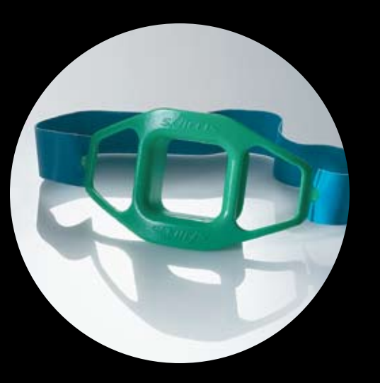
Mouthpiece protects the patient, scope and the Endo-Ease Discovery SB. This accessory is included with each device.

Not long ago, the small intestine was an unexplored frontier in GI endoscopy. New developments in enteroscopes have opened up this region of the GI tract but it remains a difficult organ to access. Small bowel enteroscopy is a technically challenging procedure often requiring much time. The Endo-Ease Discovery SB is a significant innovation in flexible GI endoscopy. This revolutionary over-tube system allows physicians to perform enteroscopies in an efficient manner. Thoughtful features built into this device combined with useful accessories create a simple yet remarkable instrument to enable enteroscopy.