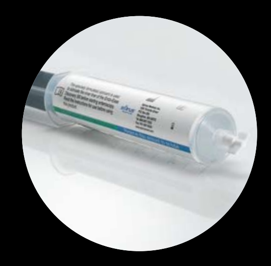
We provide our specially formulated lubricant, which is applied inside the over-tube, to enable smooth operation of the Discovery SB.