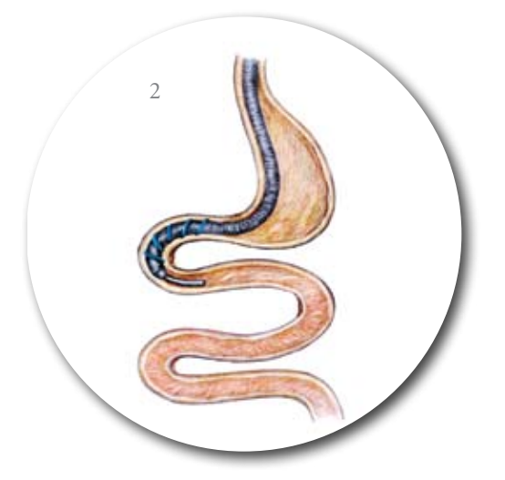
Once through the pylorus, clockwise rotation with gentle pull-back engages the spiral in the duodenum.