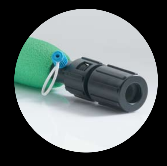
Lubrication port with luer fitting enables lubrication of the Discovery SB before and during the procedure.