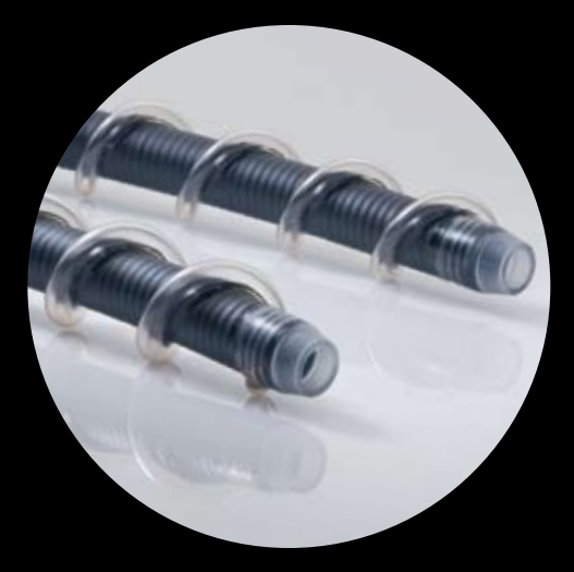
Available in two spiral heights. The standard profile spiral (foreground) is a nominal 5.5mm and the low profile spiral is a nominal 4.5mm.